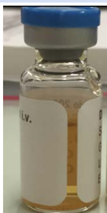
Sample from Australia

WHO requests increased vigilance within the supply chains of countries likely to be affected by these falsified products. Increased vigilance should include hospitals, clinics, health centres, wholesalers, distributors, pharmacies and any other suppliers of medical products. If you are in possession of the above products, please do not use them. If you have used these falsified products, or if you suffer an adverse reaction/event having used these products, you are advised to seek immediate medical advice from a qualified healthcare professional, and to report the incident to the National Regulatory Authorities/National Pharmacovigilance Centre.