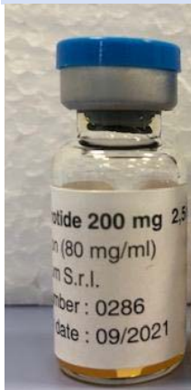
Sample from Latvia