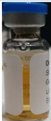
Sample from Latvia